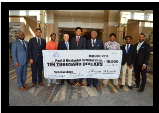
2018 Paul A. McDaniel Boulé Scholars